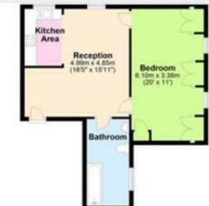
flat 5 45 High Street KL.jpg