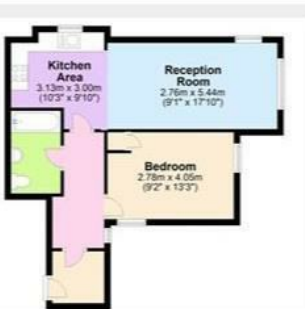
flat 3 45 High Street KL.jpg