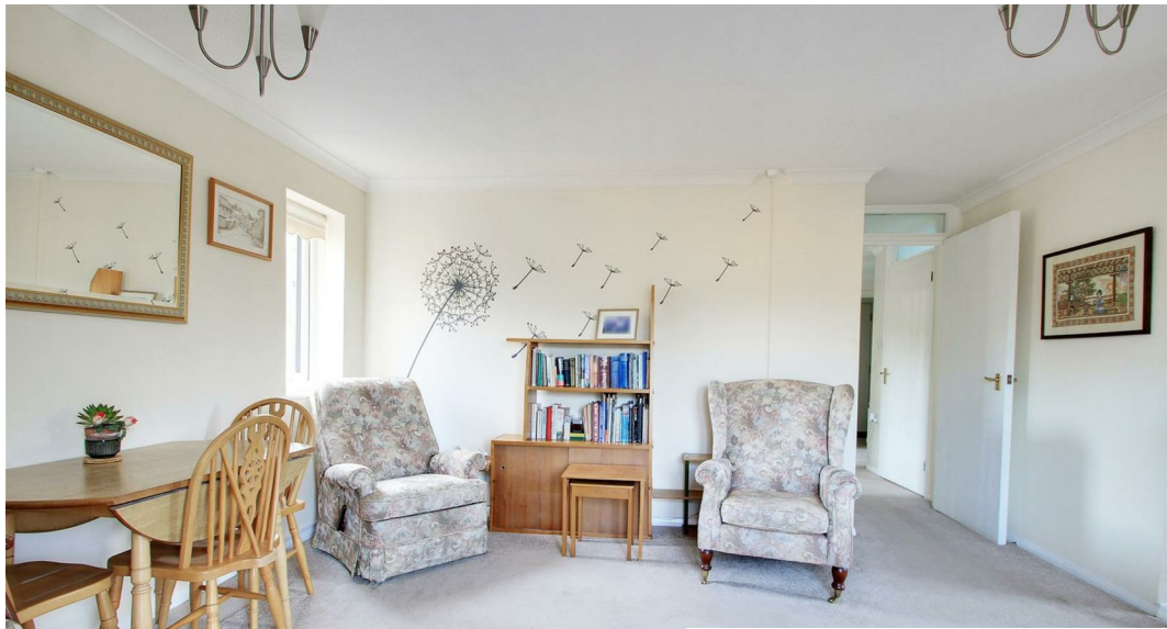
Chain Free two bedroom first floor apartment for the Over 55's