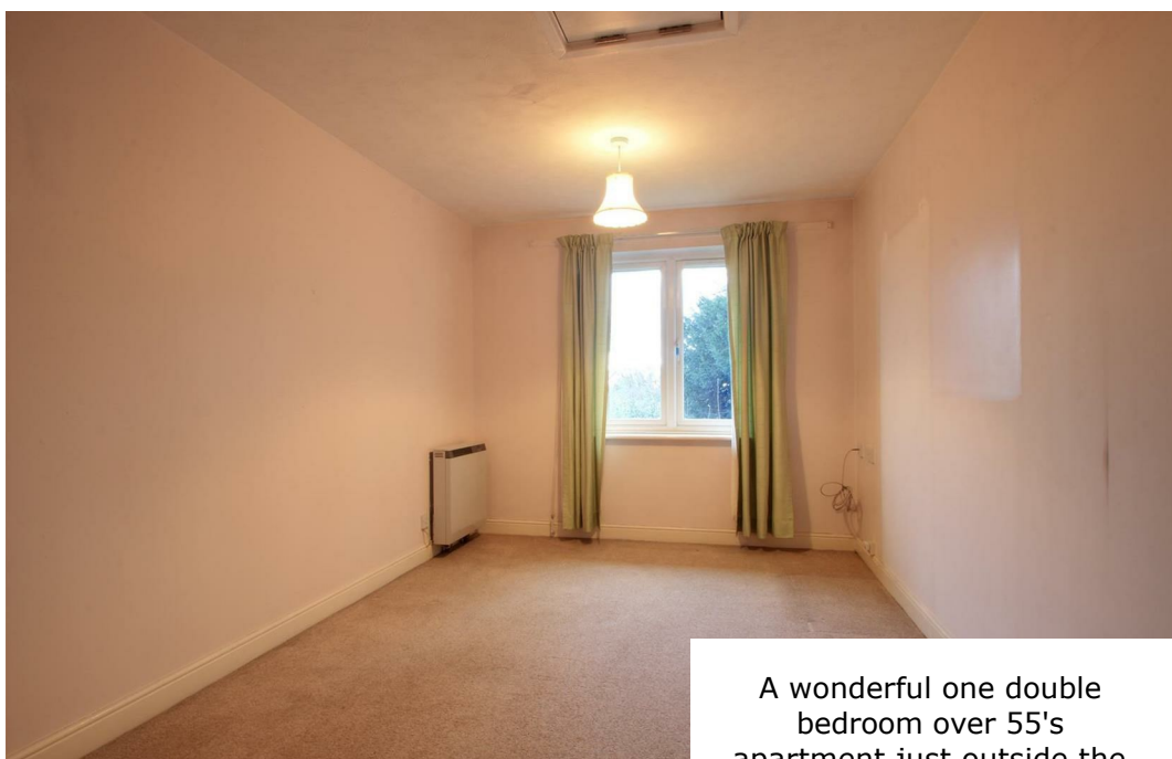
A wonderful one double bedroom over 55's apartment just outside the High Street and within easy walking distance to the train station.