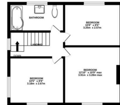
TOTAL FLOOR AREA : 813 sq.ft. (75.6 sq.m.) approx. Measurements are approximate. Not to scale. Illustrative purposes only. Made with Metropix ©2025

NOTICE Gascoigne Halman for themselves and for the vendors or lessors of this property whose agents they are give notice that: (i) the particulars are set out as a general outline only for the guidance of intending purchasers or lessees, and do not constitute, nor constitute part of, an offer or contract; (ii) all descriptions, dimensions, references to condition and necessary permissions for use and occupation, and other details are given in good faith and are believed to be correct but any intending purchasers or tenants should not rely on them as statements or representations of fact but must satisfy themselves by inspection or otherwise as to the correctness of each of them; (iii) no person in the employment of Gascoigne Halman has any authority to make or give any representation or warranty whatever in relation to this property.