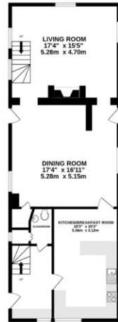
GROUND FLOOR 1369 sq.ft. (126.4 sq.m.) approx.