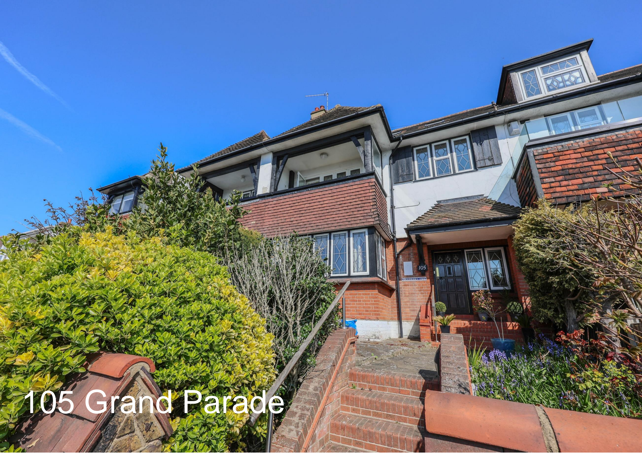
105 Grand Parade