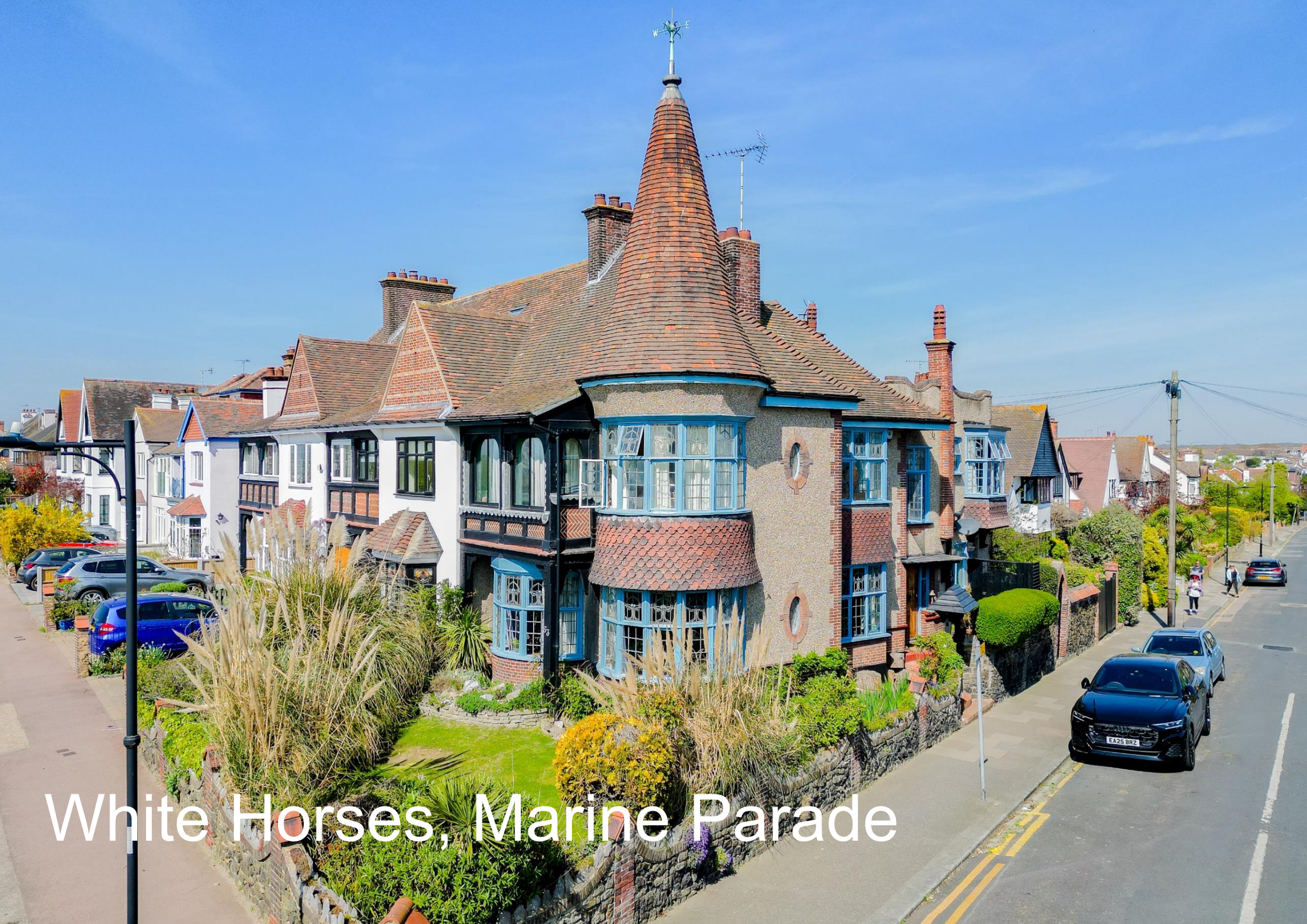
White Horses, Marine Parade