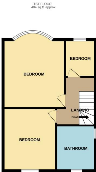
TOTAL FLOOR AREA: 1104 sq.ft. approx. Made with MetroPix ©2024