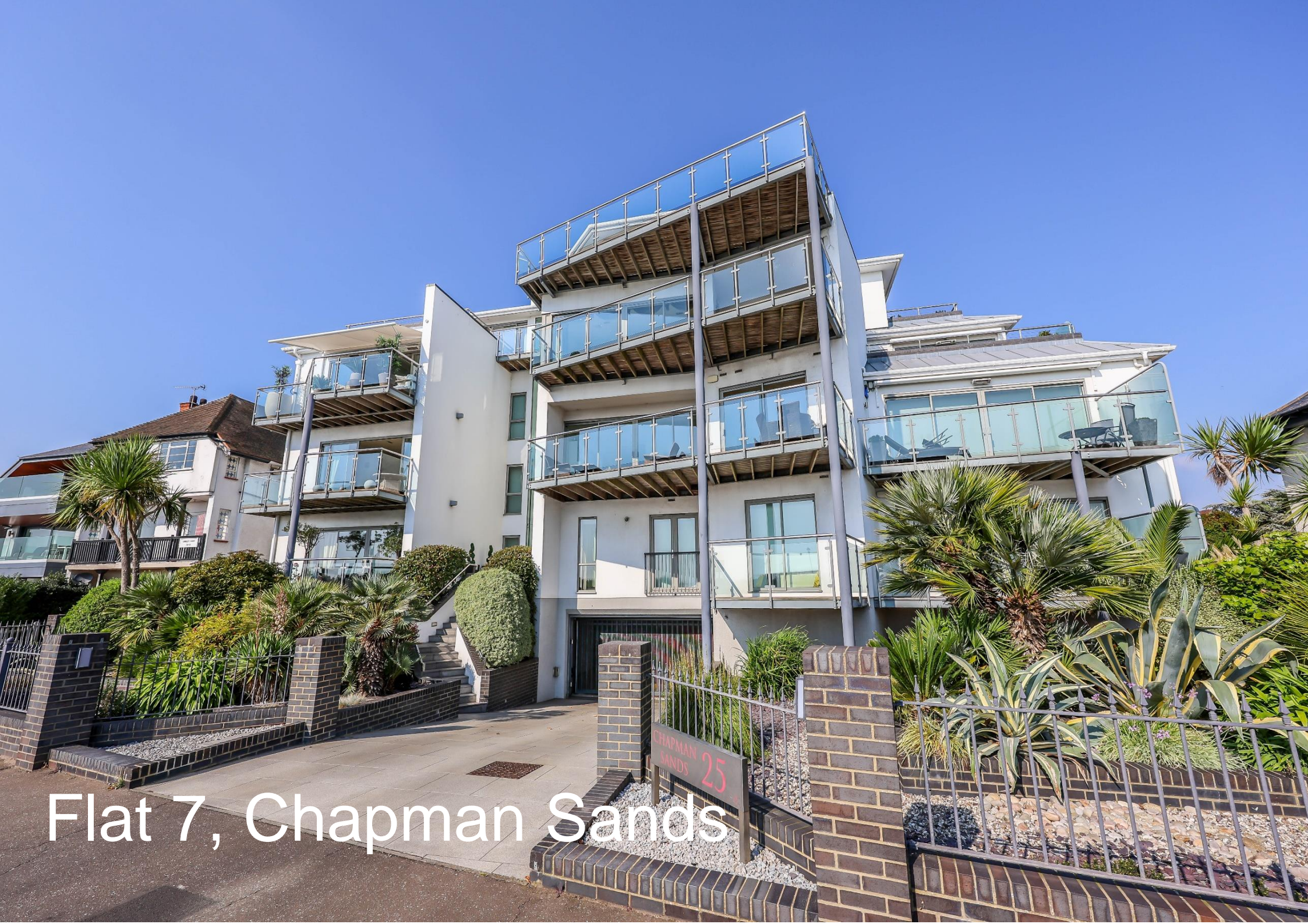
Flat 7, Chapman Sands