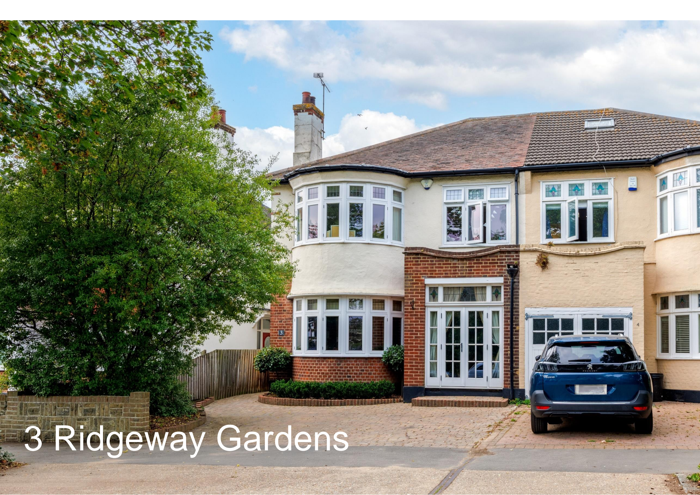
3 Ridgeway Gardens