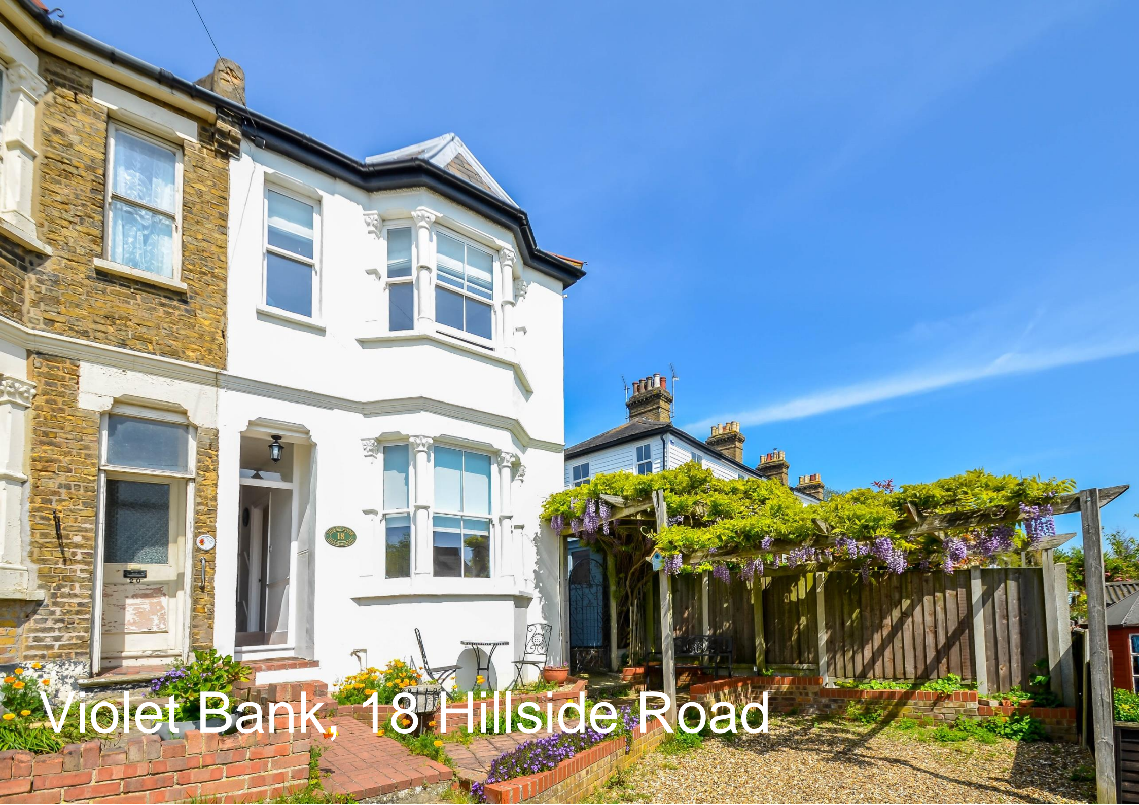
Violet Bank, 18 Hillside Road