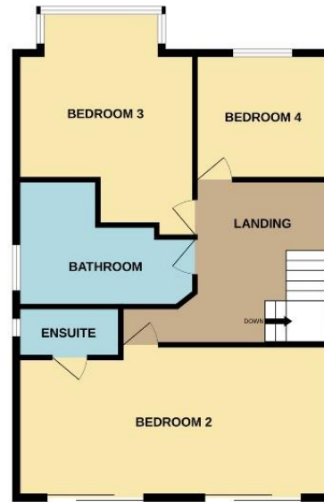
1ST FLOOR 761 sq.ft. approx.