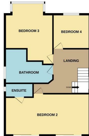
1ST FLOOR 761 sq.ft. approx.