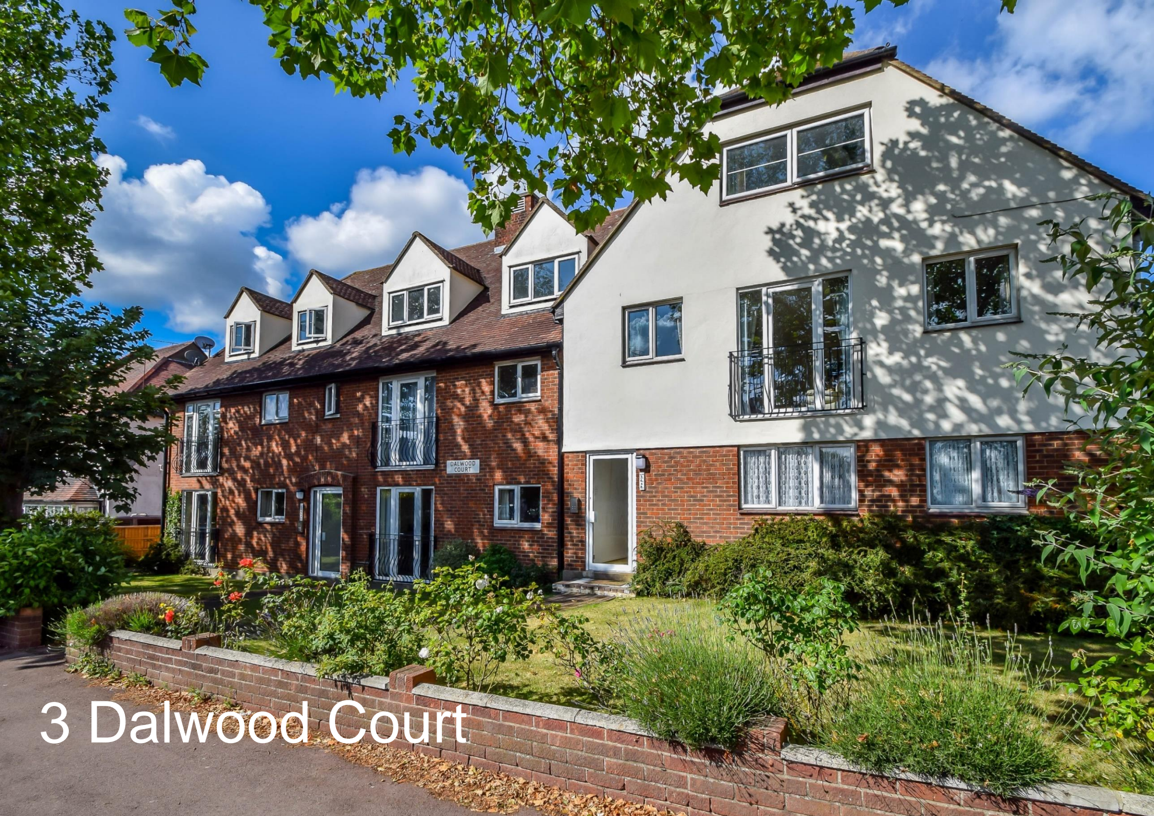
3 Dalwood Court