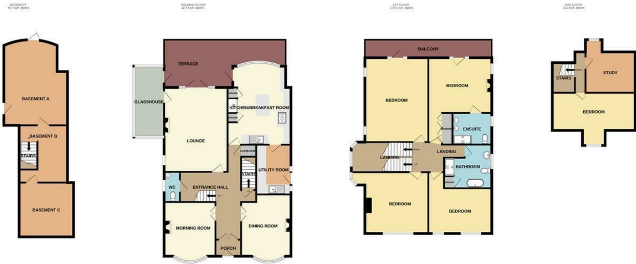
TOTAL FLOOR AREA : 3079 sq.ft. approx. Made with Metropix ©2024