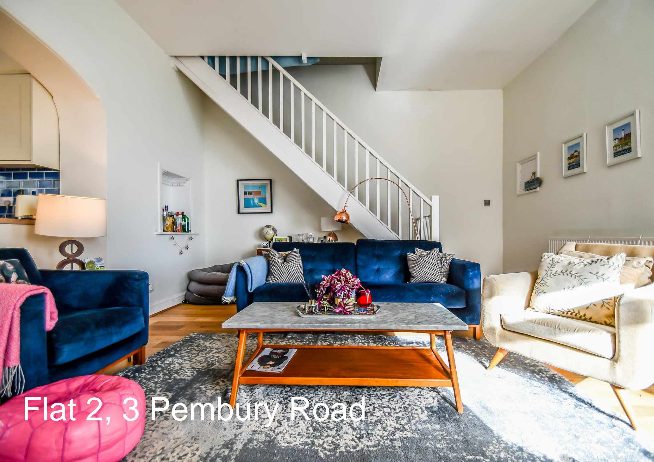
Flat 2, 3 Pembury Road