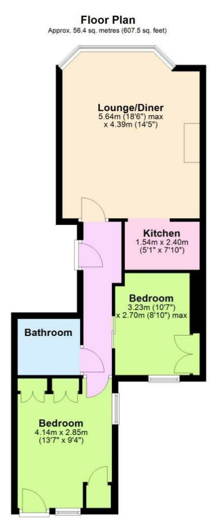
Total area: approx. 56.4 sq. metres (607.5 sq. feet)