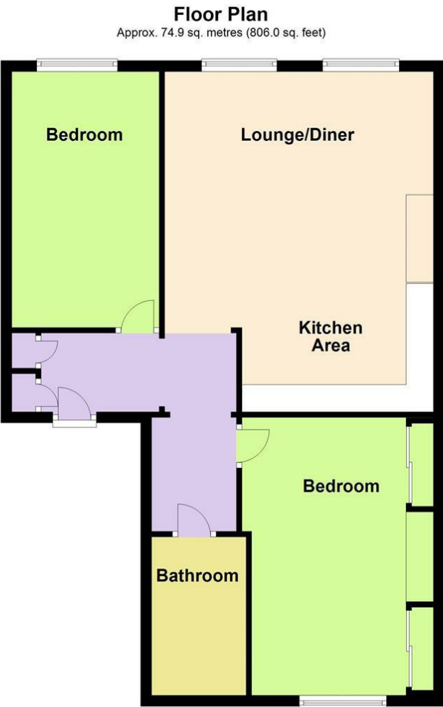
Total area: approx. 74.9 sq. metres (806.0 sq. feet)