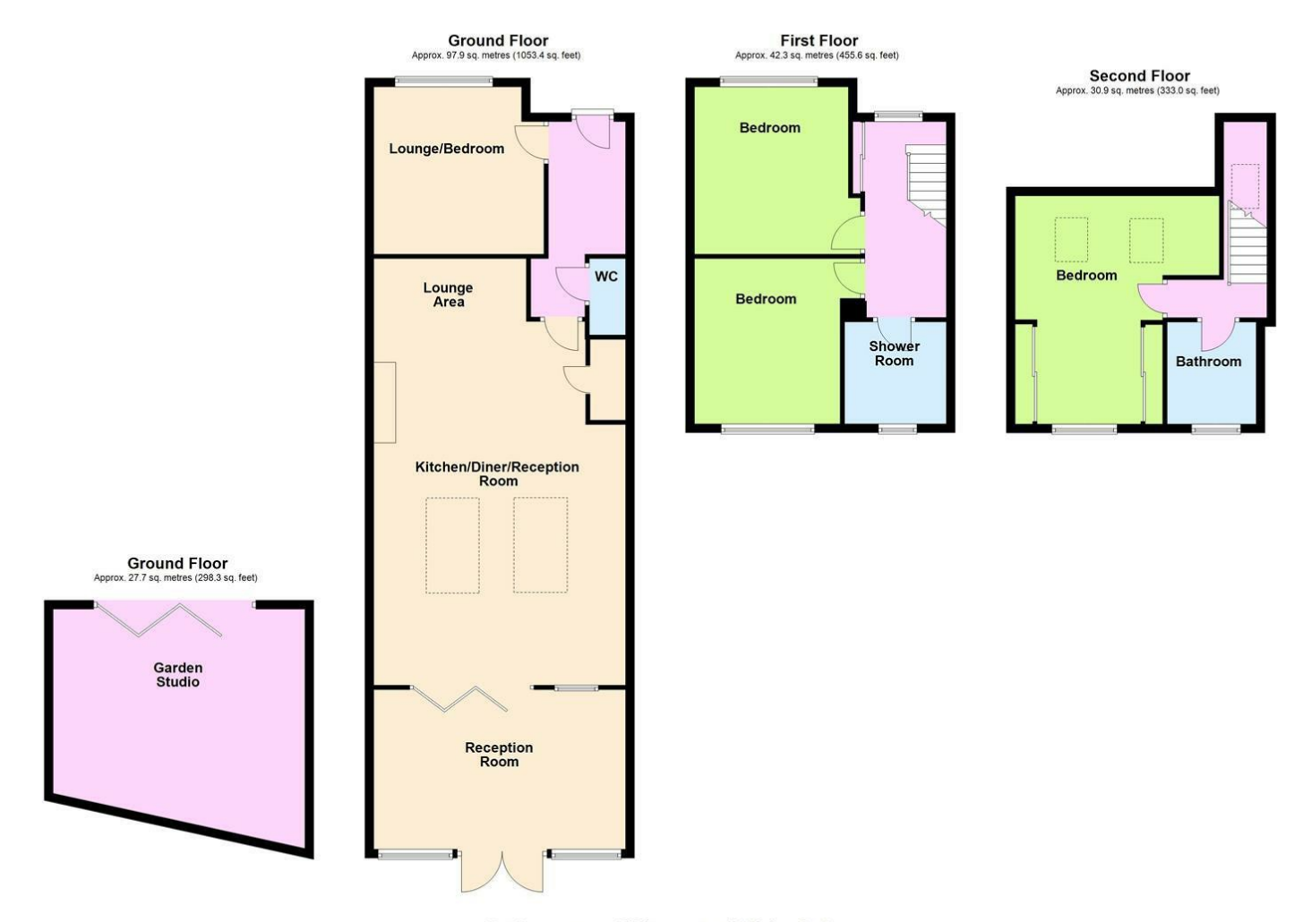
Total area: approx. 198.9 sq. metres (2140.4 sq. feet)