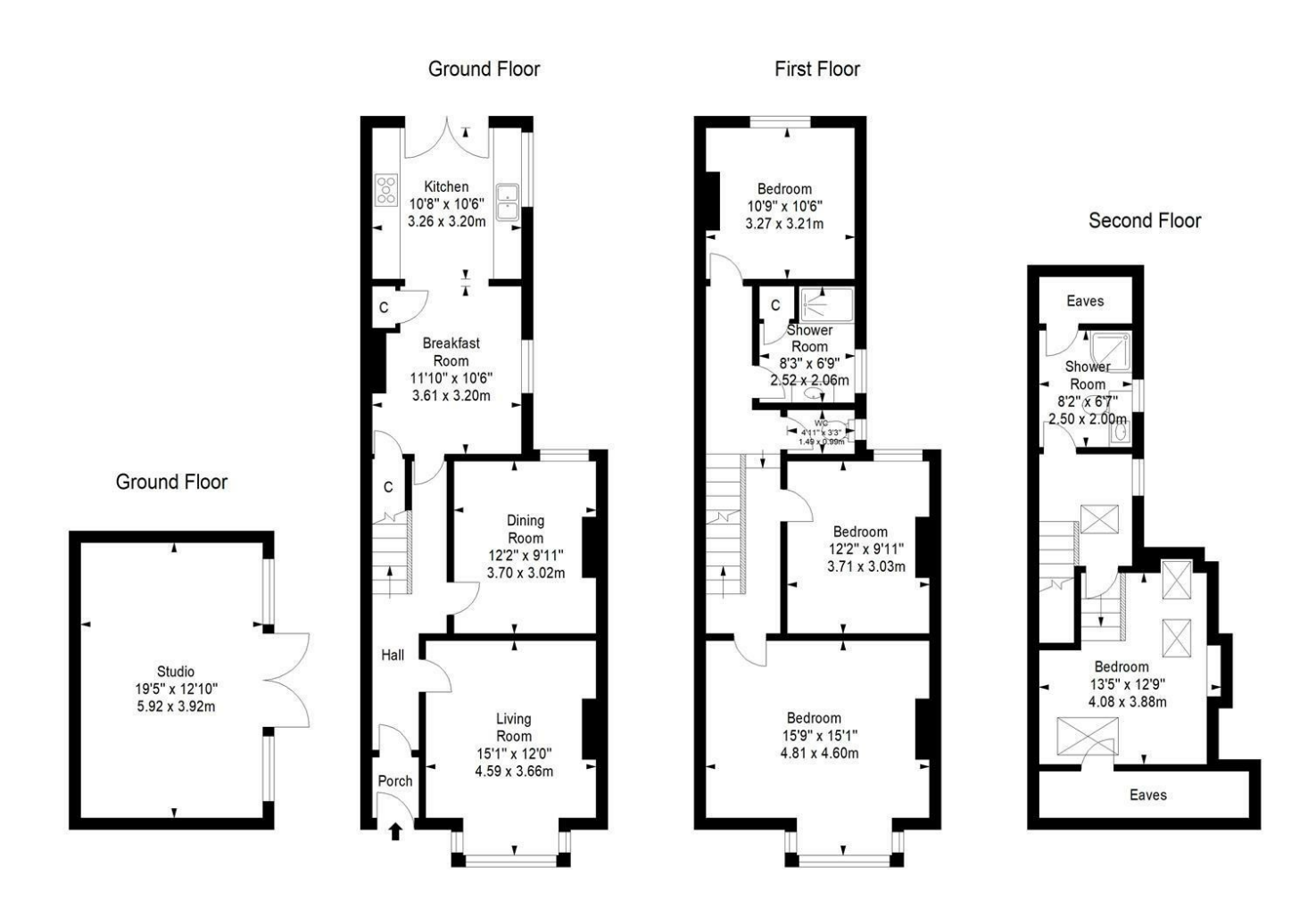
Approximate gross internal floor area 171.2 sq m/ 1842.8 sq ft