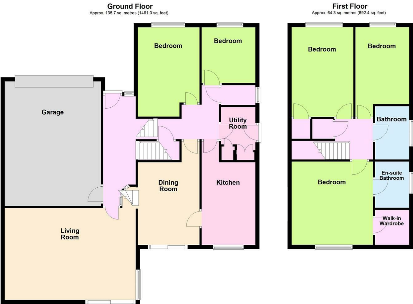
Total area: approx. 200.1 sq. metres (2153.4 sq. feet)