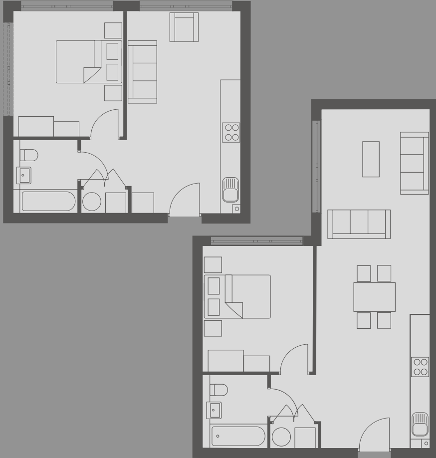
TYPE B • ONE BED