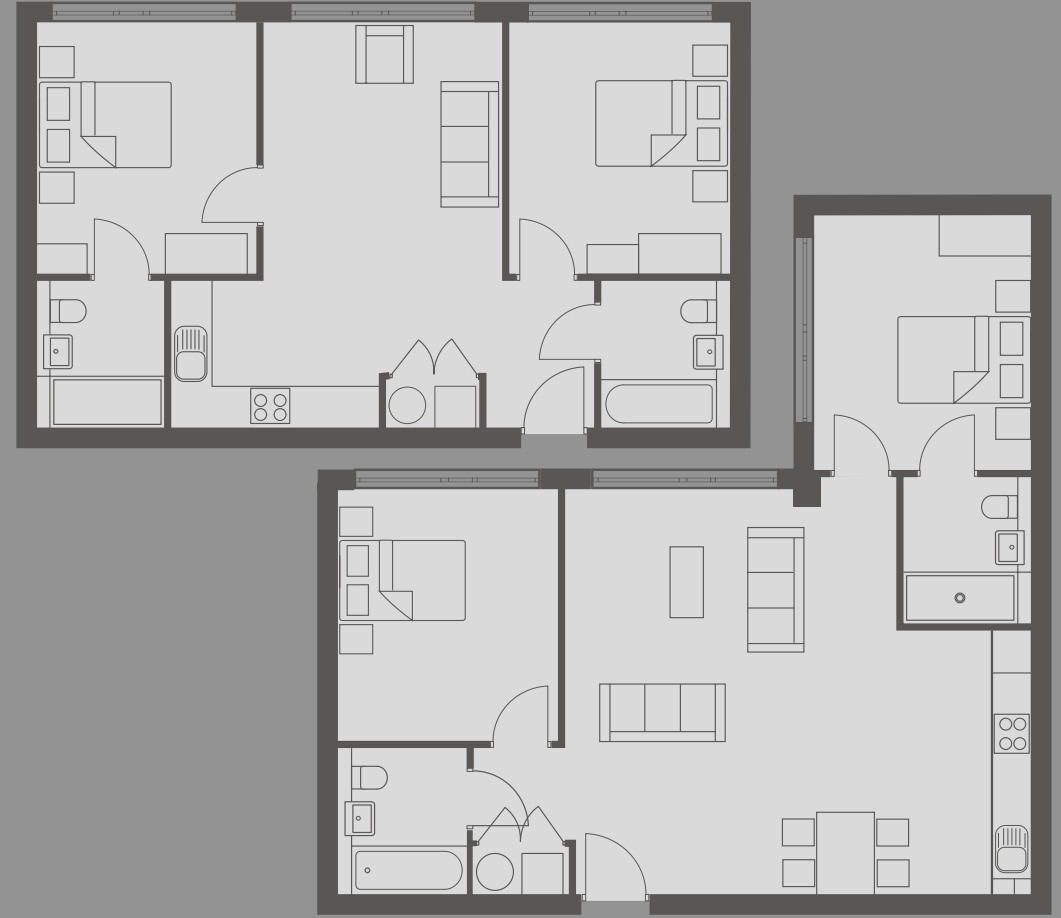
TYPE B • TWO BED