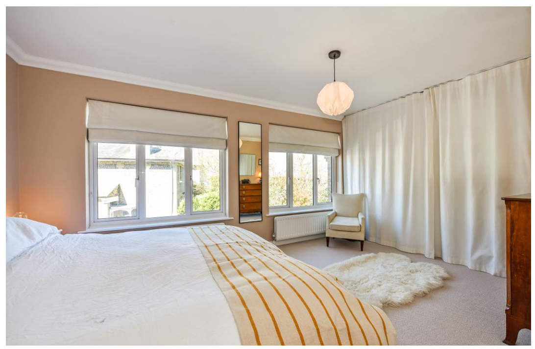
UPSTAIRS: Stairs rise from the hall to the first floor. PRINCIPAL BEDROOM: The principal bedroom is a wonderful double room with two sets of windows flooding the room with light and there is a useful range of cupboards and shelving cleverly concealed behind a large curtain area. The ensuite shower room features a large walk-in shower cubicle with classic vintage green brick style tiling, ceramic pedestal basin and wc. There are wonderful views from each of the upstairs front bedrooms across to the Arbour.