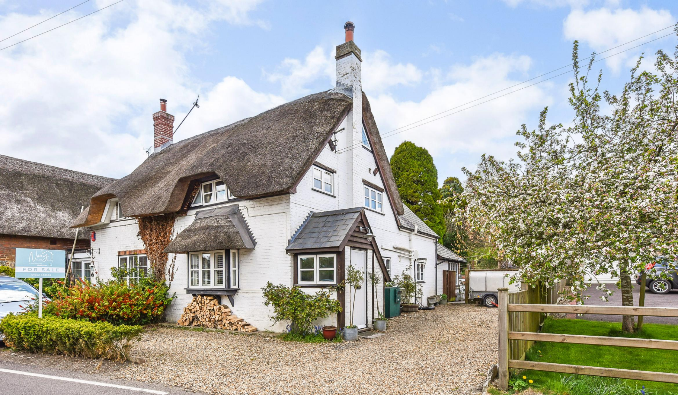
Mary Cottage, 35 Northbrook, Micheldever, SO21 3AJ Offers Over £550,000 Freehold