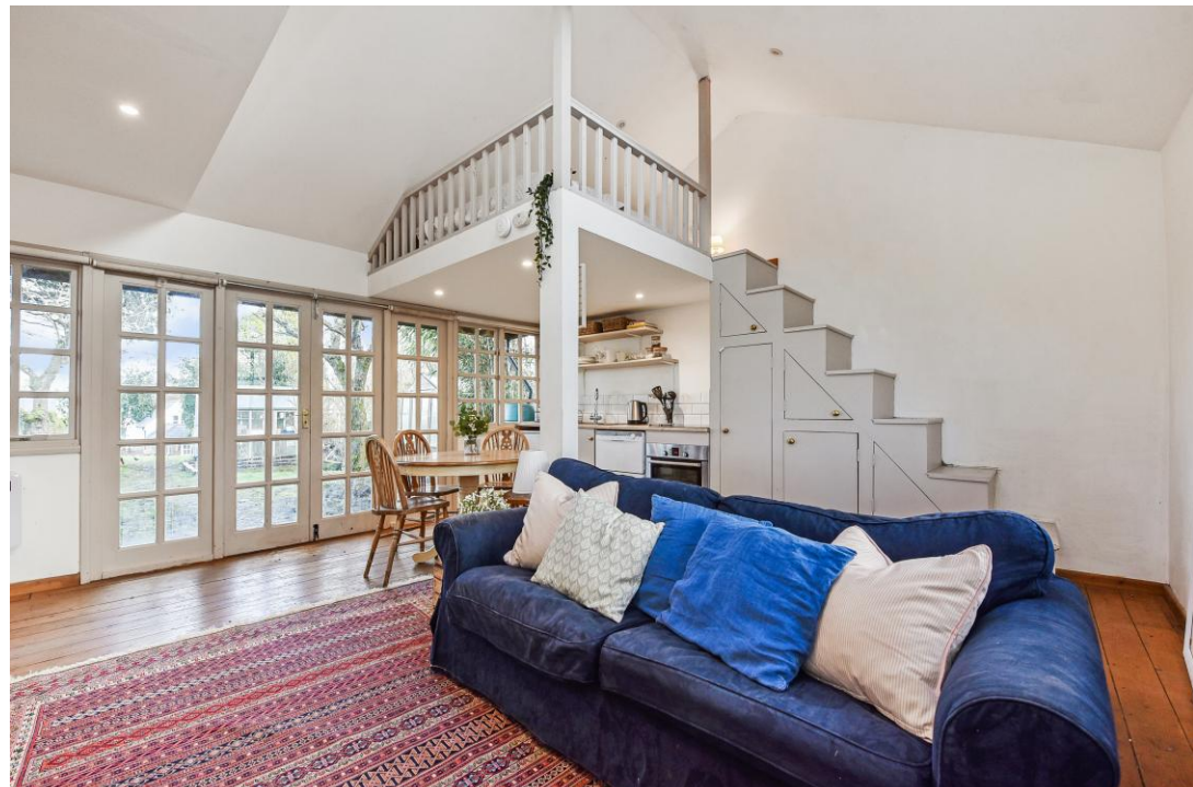
GARDEN STUDIO (AND LAUNDRY ROOM) The rear of the garden backs onto open fields, where there is a recently renovated studio/home office building with a charming vintage woodburning stove. (Garden Room EPC: TBA)

This studio would be ideal for home crafts or those working from home, and benefits from power and light, a shower room and kitchen area. Adjoining the studio is a garden store currently also used as a laundry room, with space and plumbing for a washing machine and tumble dryer.