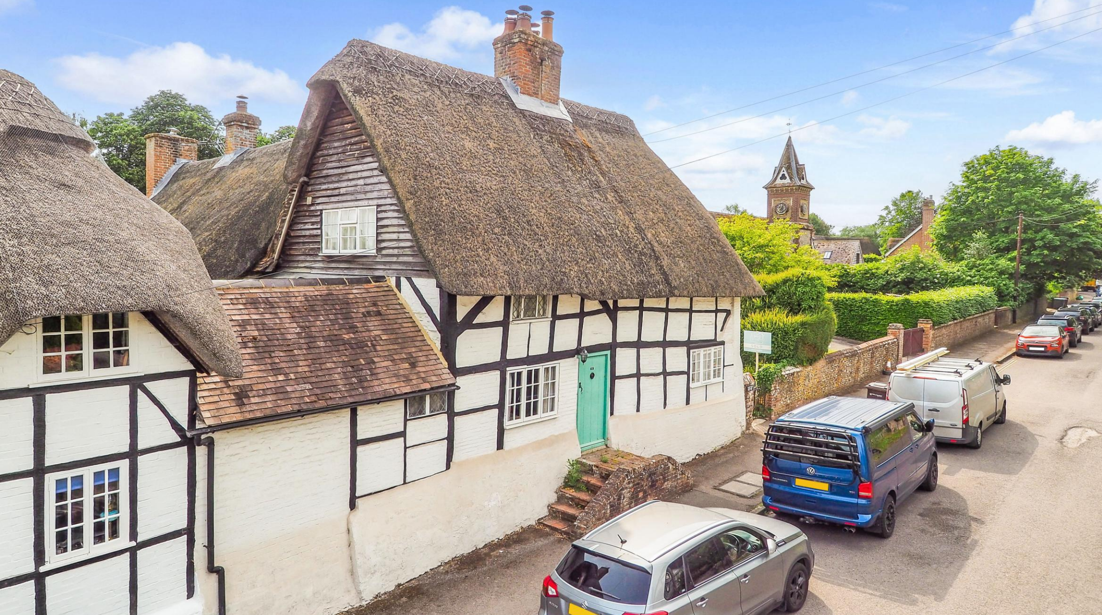
The Old Post Office, 63-67 Church Street, Micheldever, SO21 3DB Guide Price £975,000 Freehold