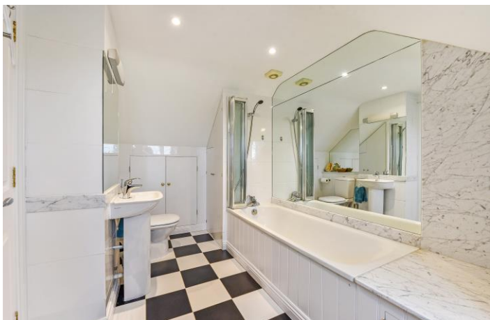
SECOND FLOOR: On the second floor, there is a fabulous guest bedroom, with large double bedroom area overlooking the garden, and with far reaching views of the allotments, River Test, and fields beyond. There are two walls of wardrobes which lead through to a superb ensuite bathroom, with bath and shower over, and fitted eaves storage cupboards.