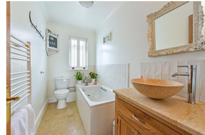
BEDROOMS AND BATHROOMS: Across the landing from the sitting room, there is an ensuite bedroom, which has a fitted double wardrobe cupboard and a spacious ensuite shower room. On the second floor, there are two further double bedrooms, one with a glorious view of the church, and the other overlooks the garden, and a modern family bathroom.