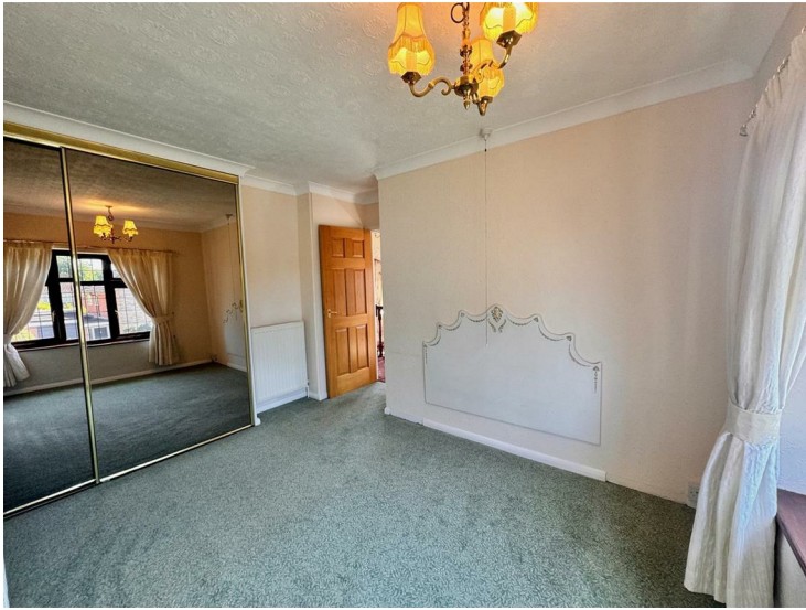
Having carpeted flooring, radiator, plain coving to the ceiling, fitted wardrobes and window to the front.