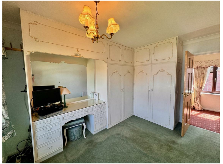
Having carpeted flooring, radiator, fitted wardrobes with dressing table and window to the side.