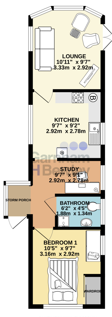
5 NUTHATCH WAY - FLOORPLAN

Whilst every attempt has been made to ensure the accuracy of the floorplan contained here, measurements of doors, windows, rooms and any other items are approximate and no responsibility is taken for any error, omission or mis statement. This pain is for illustrative purposes only and should be used as such by any prospective purchaser. The services, systems and appliances shown have not been tested and no guarantee as to their operability or efficiency can be given. Made with Metropix ©2024