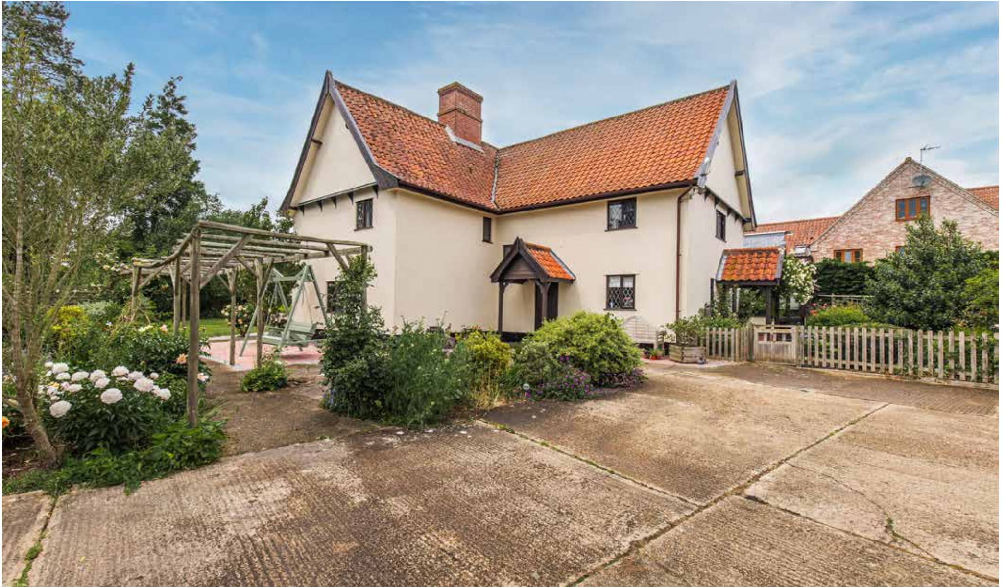
Tanns Lodge North Lopham | Diss | Norfolk | IP22 2LZ