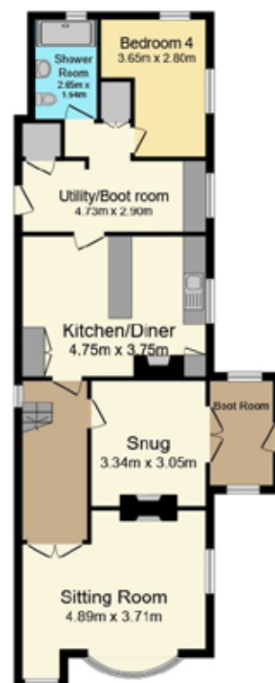
Ground Floor Floor area 87.9 sq.m.