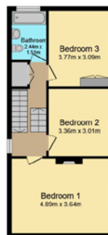
First Floor Floor area 53.8 sq.m.