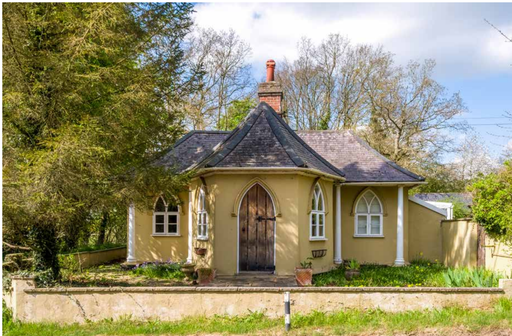
South Lodge Witnesham | Ipswich | Suffolk | IP6 9EZ