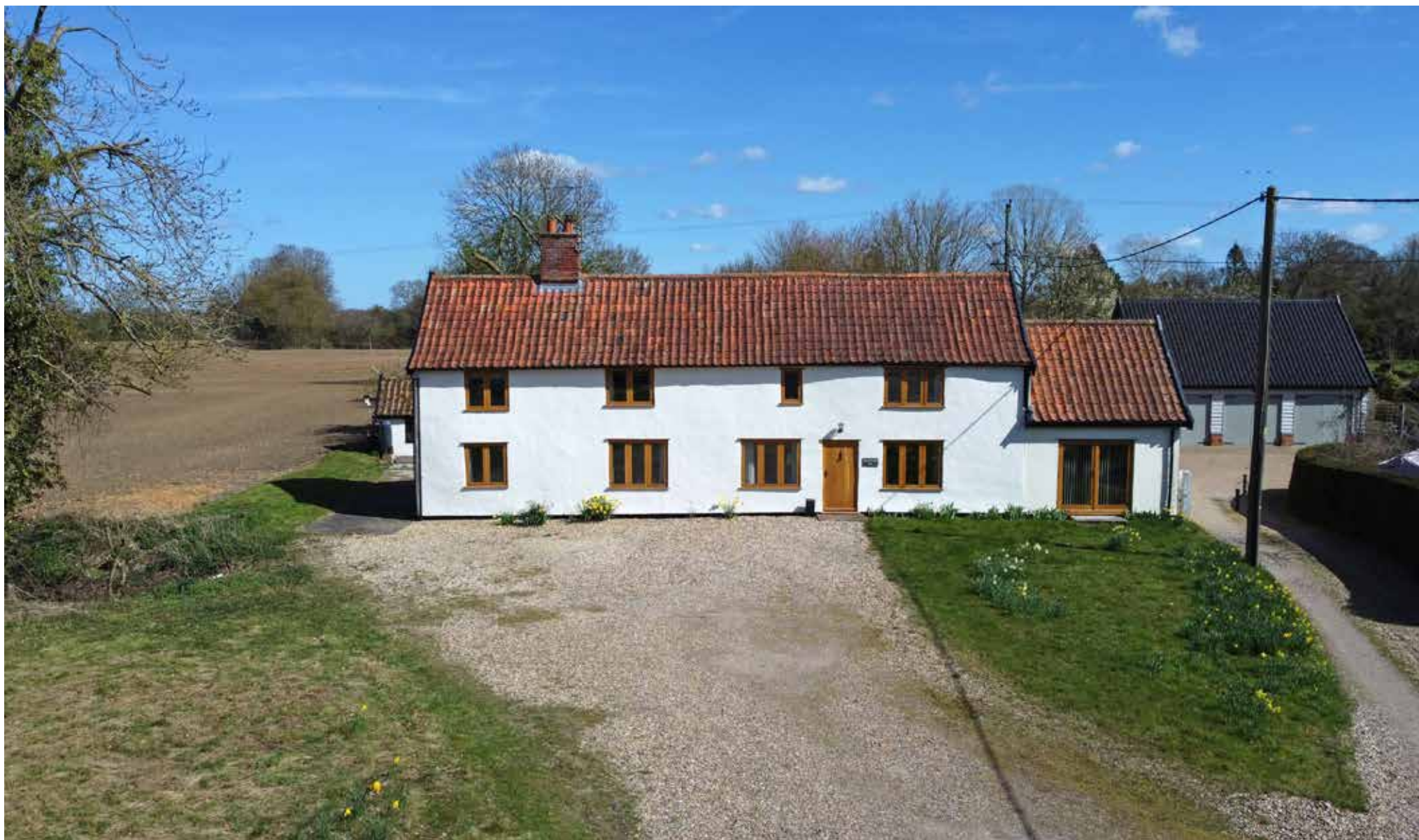
The Old Plough Inn Southolt | Eye | Suffolk | IP23 7QJ