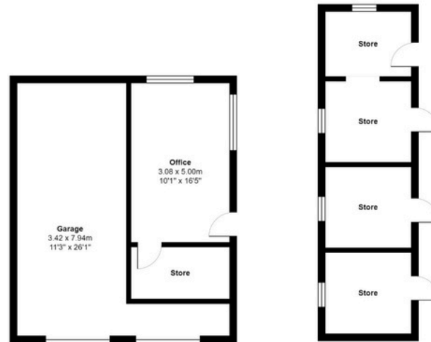
Garage & Office Area: 52.9 m 2 ... 569 ft 2