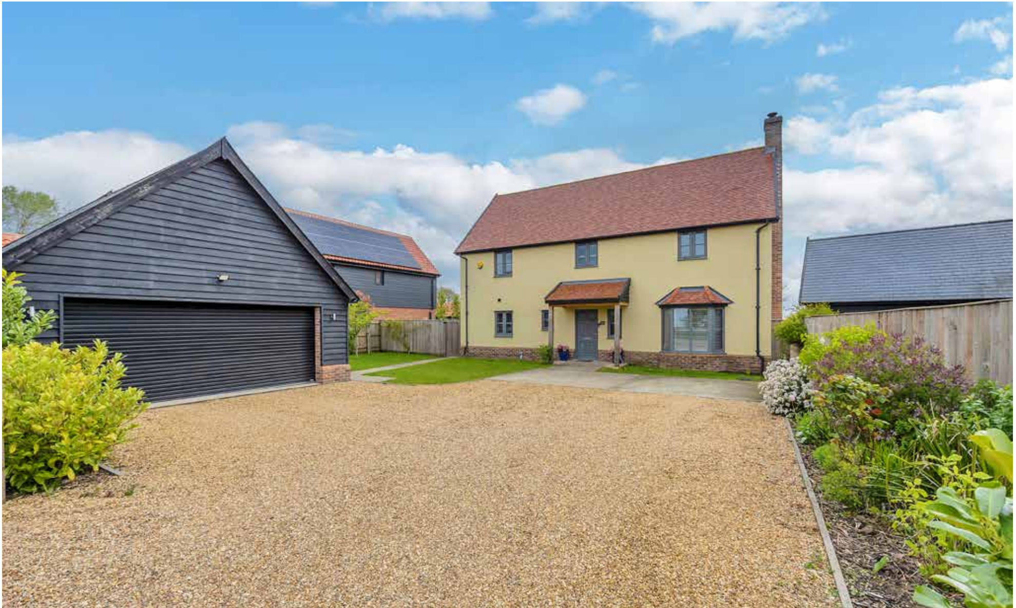
Autumn House Wortham, Suffolk | IP22 1PS