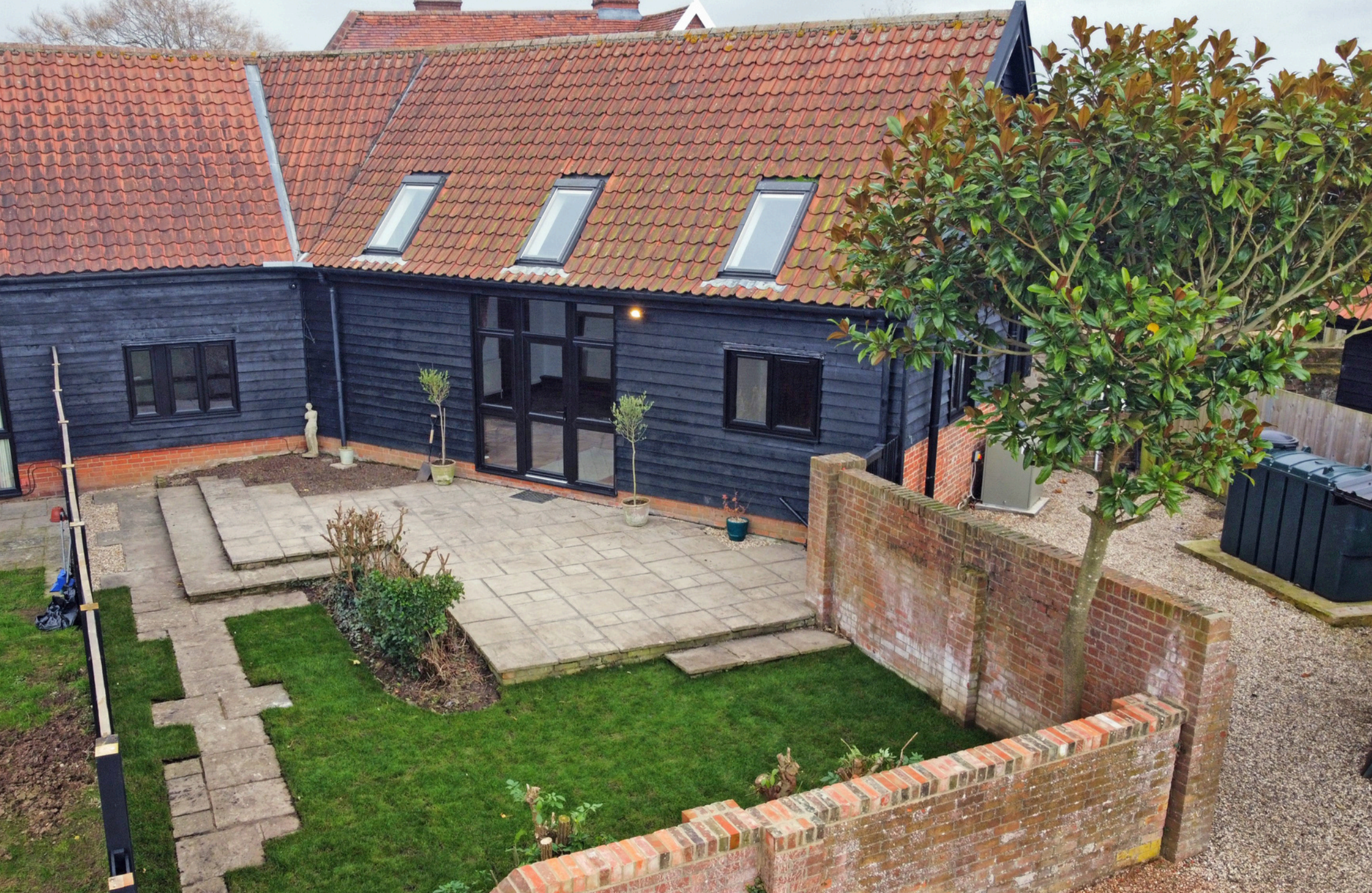
Poplar Hall Barn South | Low Road | Debenham | Suffolk | IP14 6BS