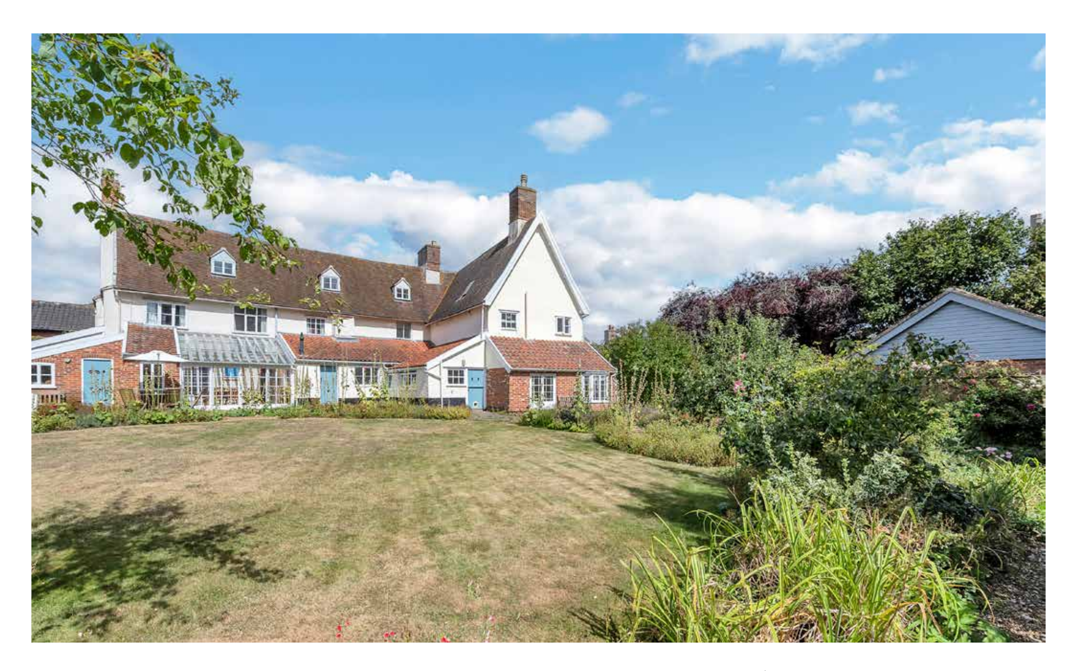
The Vinery 42 Church Street | Eye | Suffolk | IP23 7BD