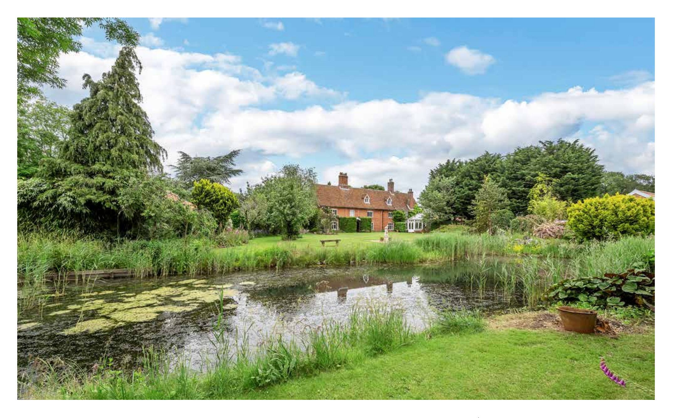
Highfields Farmhouse Mill Lane | Thorpe Abbotts | Norfolk | IP21 4JA