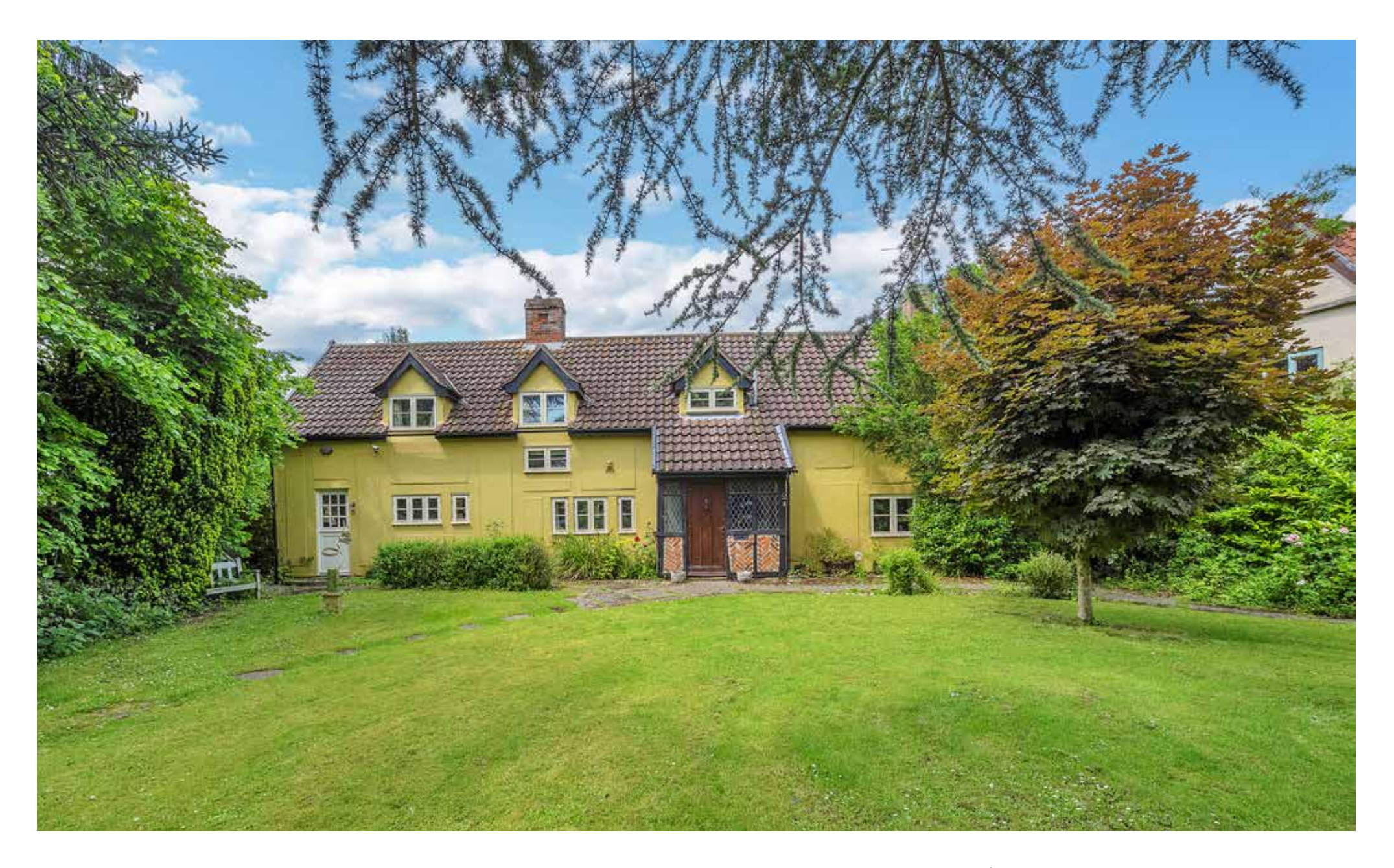
Paddock Cottage Mill Road | Battisford, Stowmarket | Suffolk | IP14 2LL