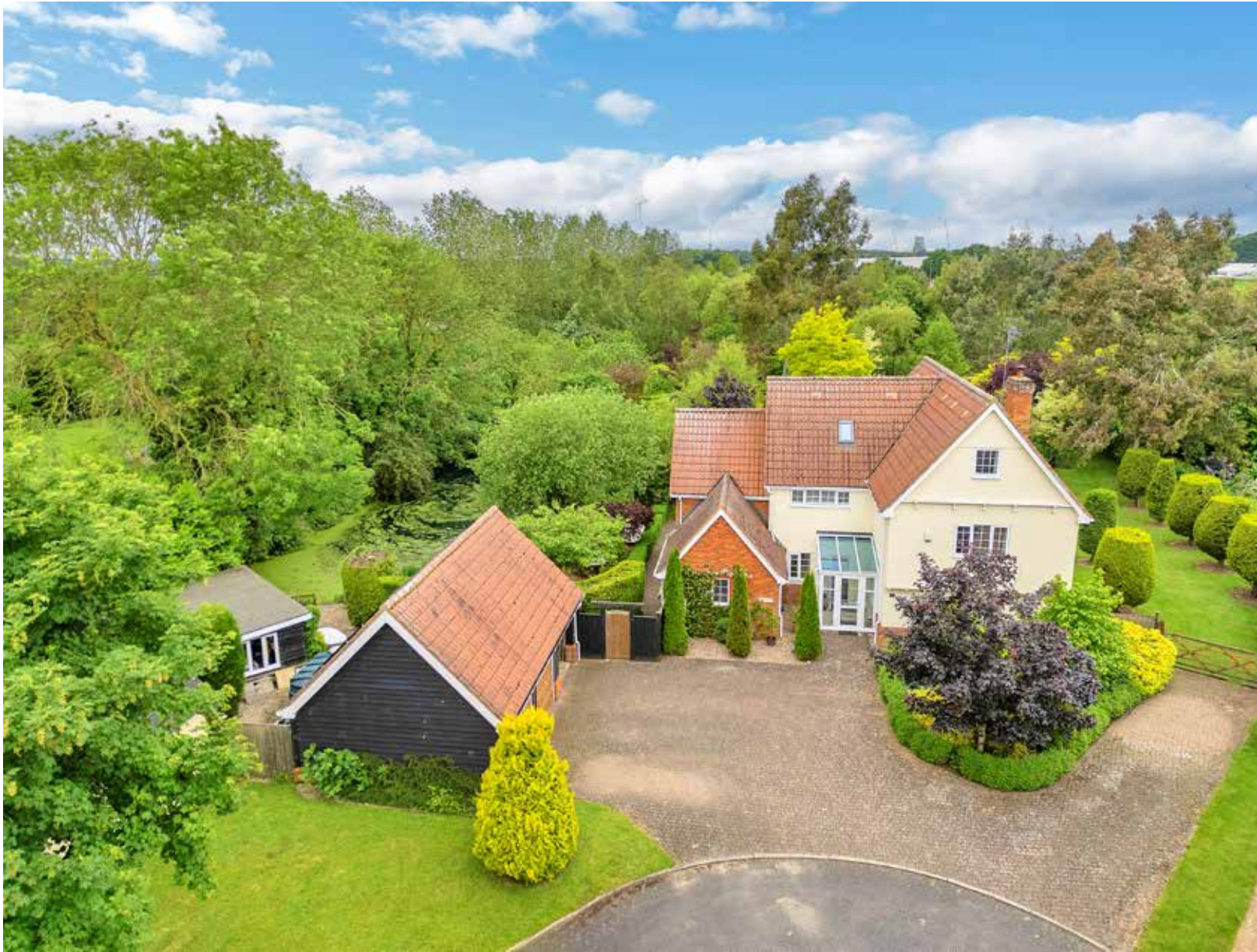
The Grange 1 Langton Park | Eye | Suffolk | IP23 7LZ