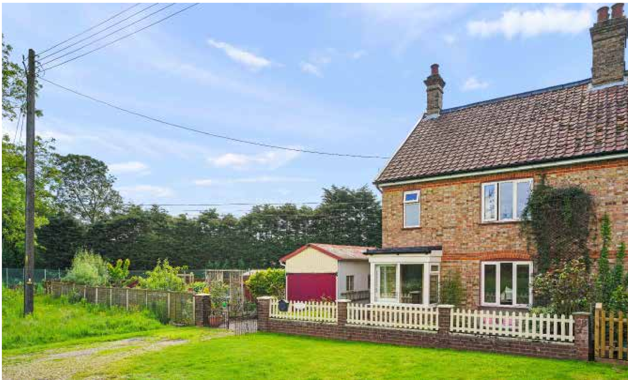
Farthing Cottage (previously known as New House) The Common | Mellis | Suffolk | IP23 8EE