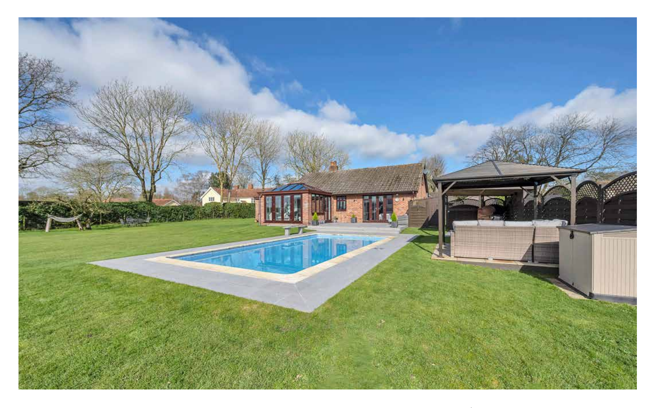
Thalia The Entry | Wickham Skeith | Suffolk | IP23 8LY