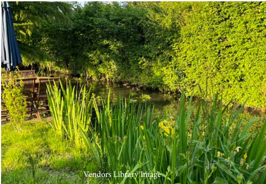
Vendors Library Image