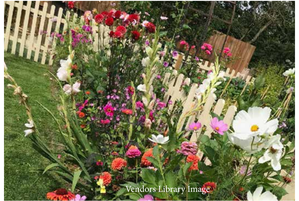
Vendors Library Image