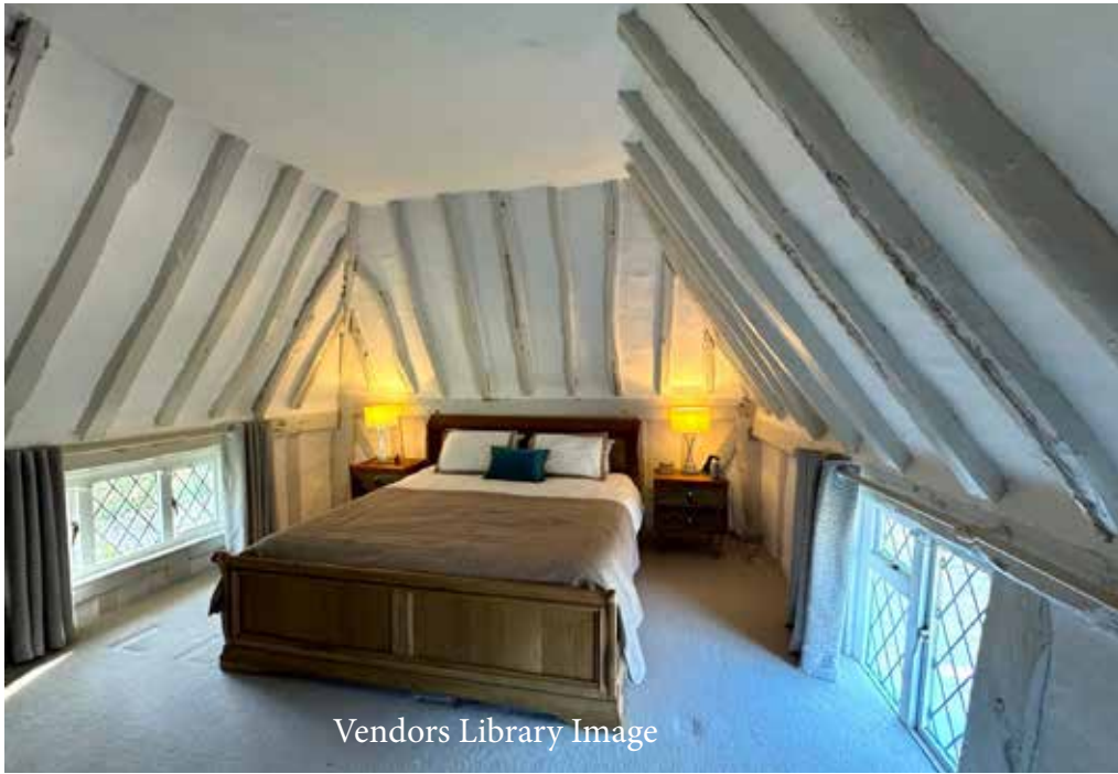
Vendors Library Image