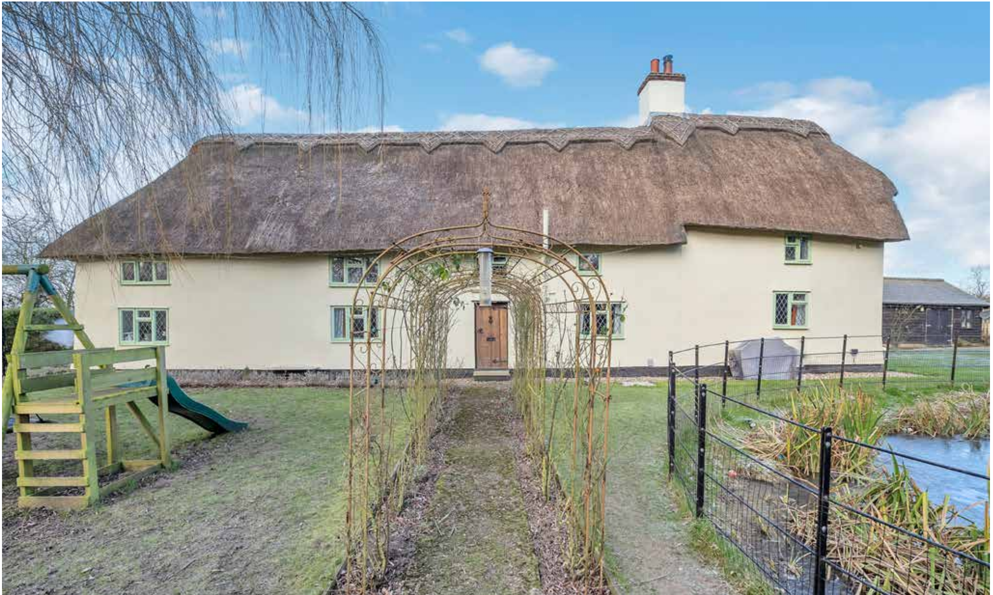
'HISTORIC MOATED FARMHOUSE' Hunters Moon, Mendlesham, Suffolk | IP14 5SW