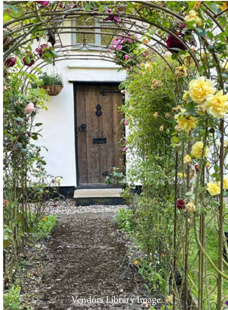
Vendors Library Image

Lovers of ancient houses, this one's for you – but hurry, the opportunity to own a house built in the reign of Henry VII is one that doesn't come around too often! Under the beautiful thatch is plenty of room for all in this superbly appointed historic home – four double bedrooms, two bathrooms, three large reception rooms and a state-of-the-art hand-built kitchen.