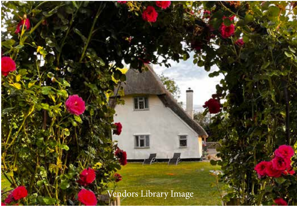
Vendors Library Image