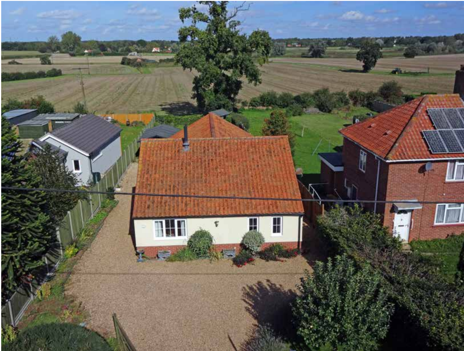
'SINGLE STOREY VILLAGE LIVING' Dickleburgh, Norfolk | IP21 4NW