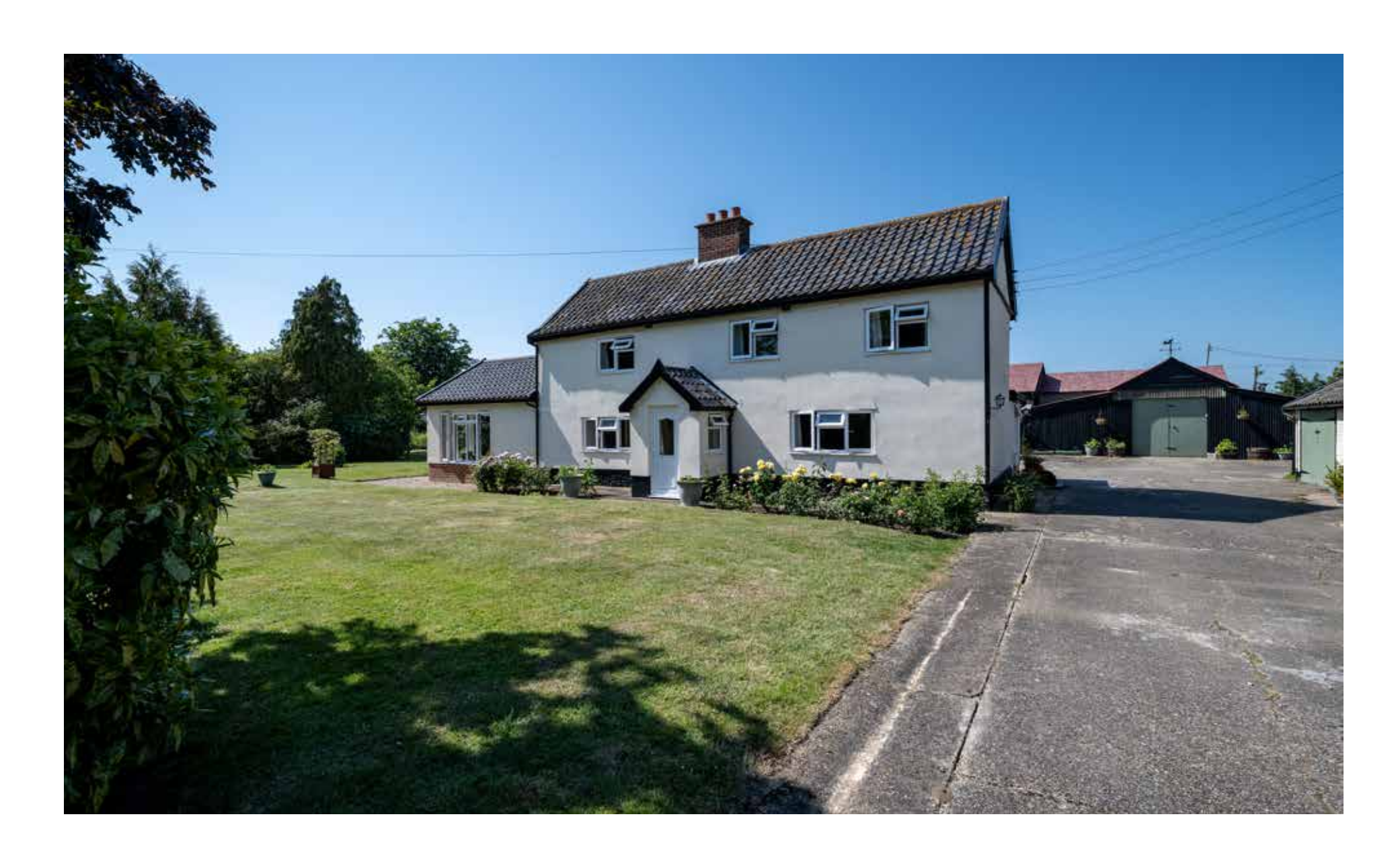
TRANQUIL FARMHOUSE WITH MULTIPLE OUTBUILDINGS Rickinghall, Suffolk | IP22 1LU