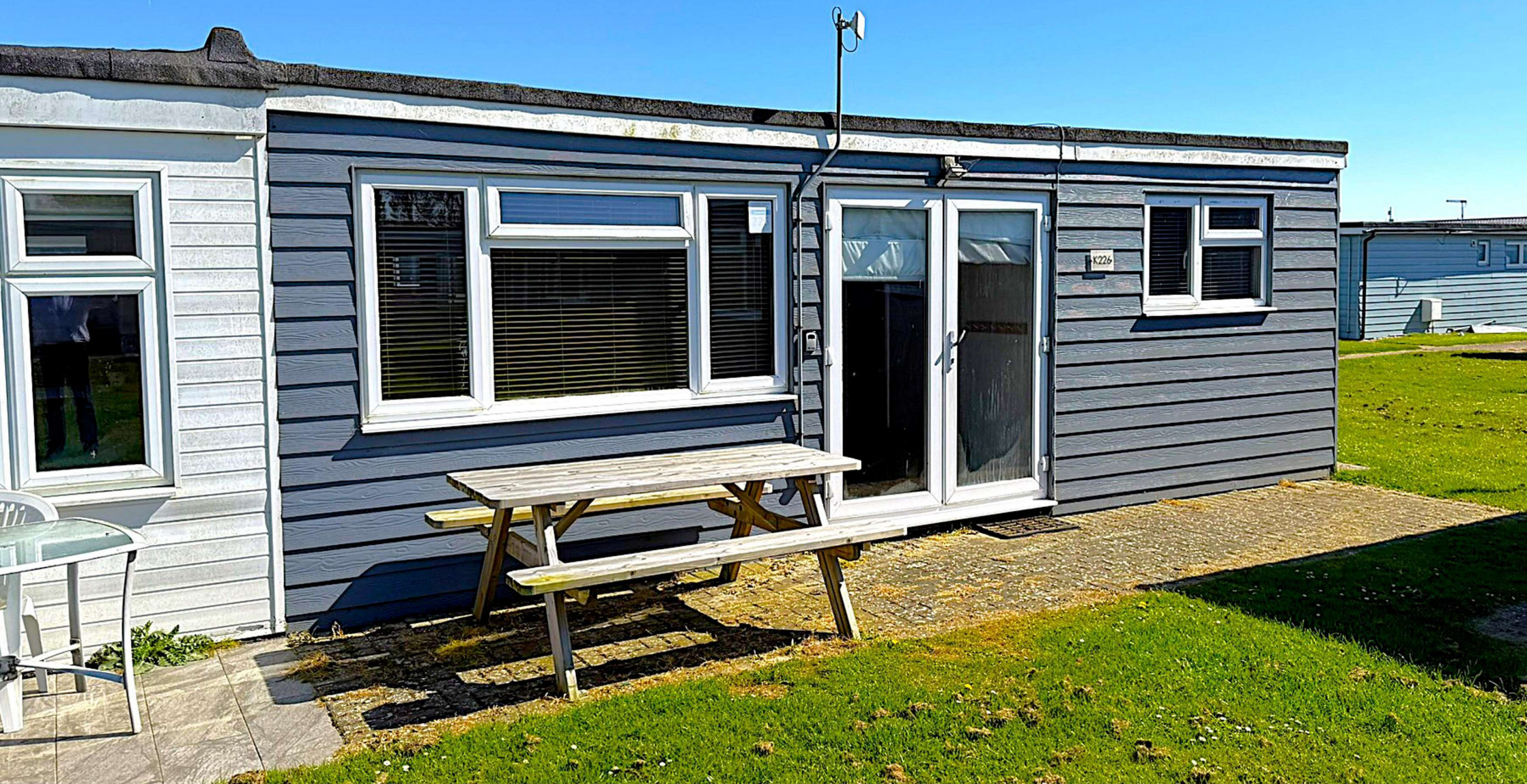
CHALET K226, CAMBER SANDS HOLIDAY PARK, LYDD ROAD, CAMBER, EAST SUSSEX, TN31 7RT