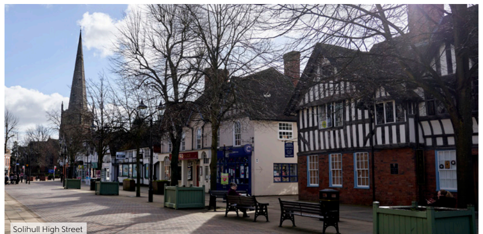
Solihull High Street