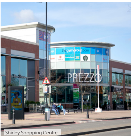
Shirley Shopping Centre

Designed in a mix of styles to suit all lifestyles, all homes are built to a high level of specification which includes modern fitted kitchens, open plan living areas and contemporary bathrooms. In addition, each home benefits from either garages or allocated parking.