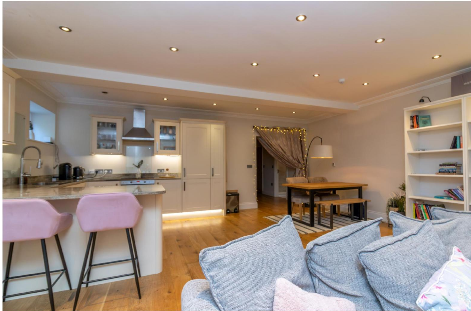
At home in Bishops Sutton