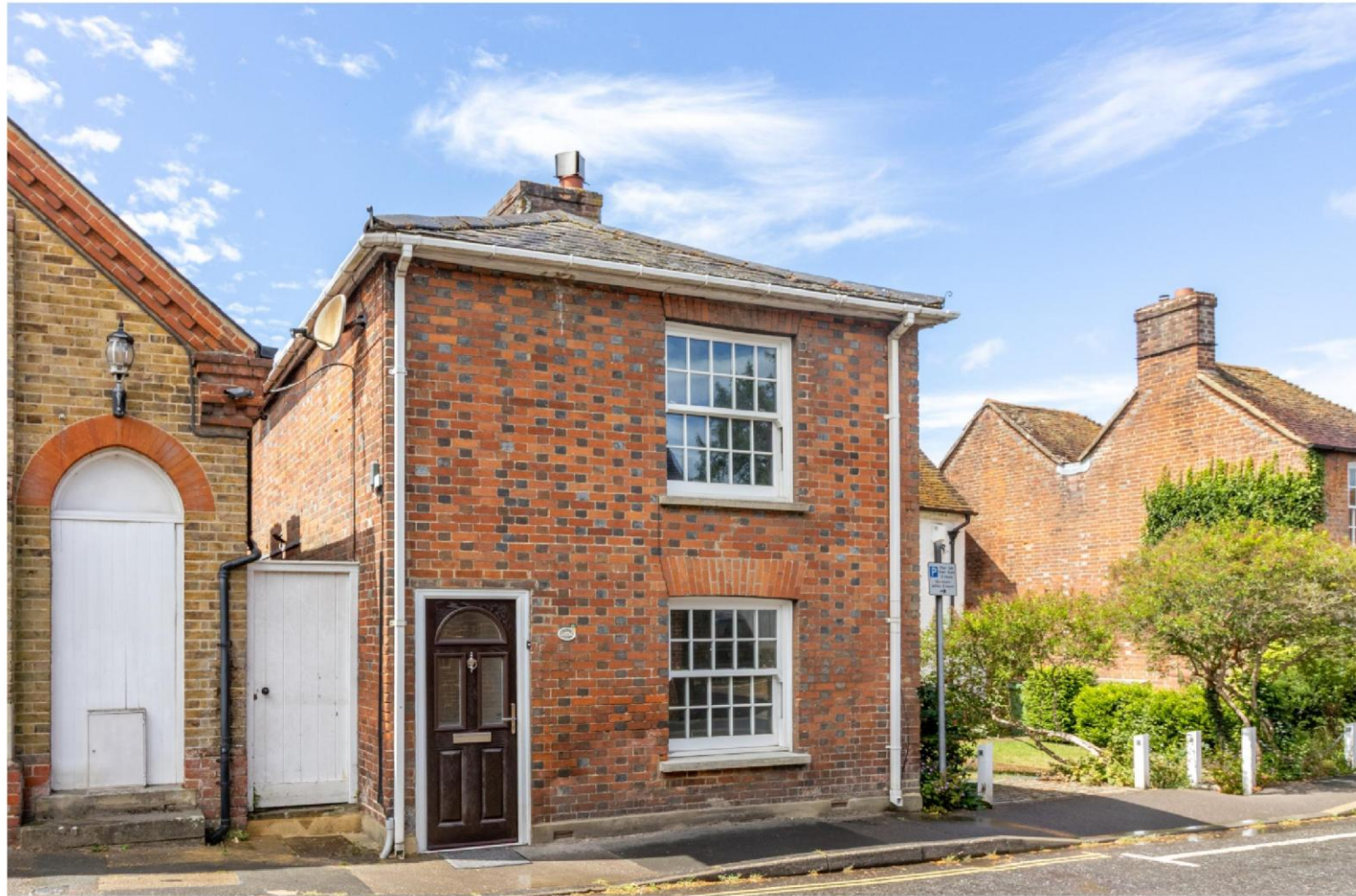
At home inn Alresford