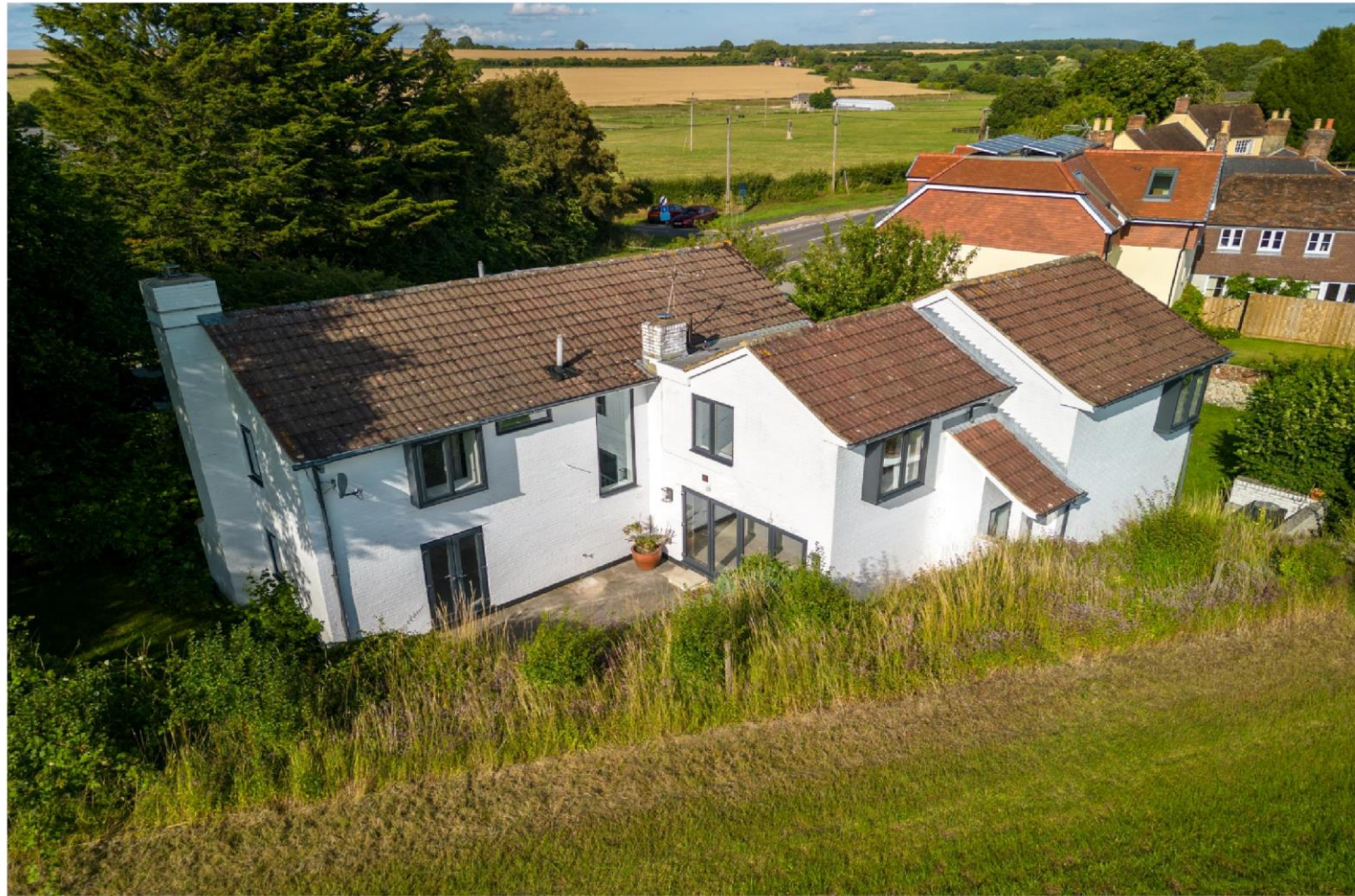
At home in Bishops Sutton